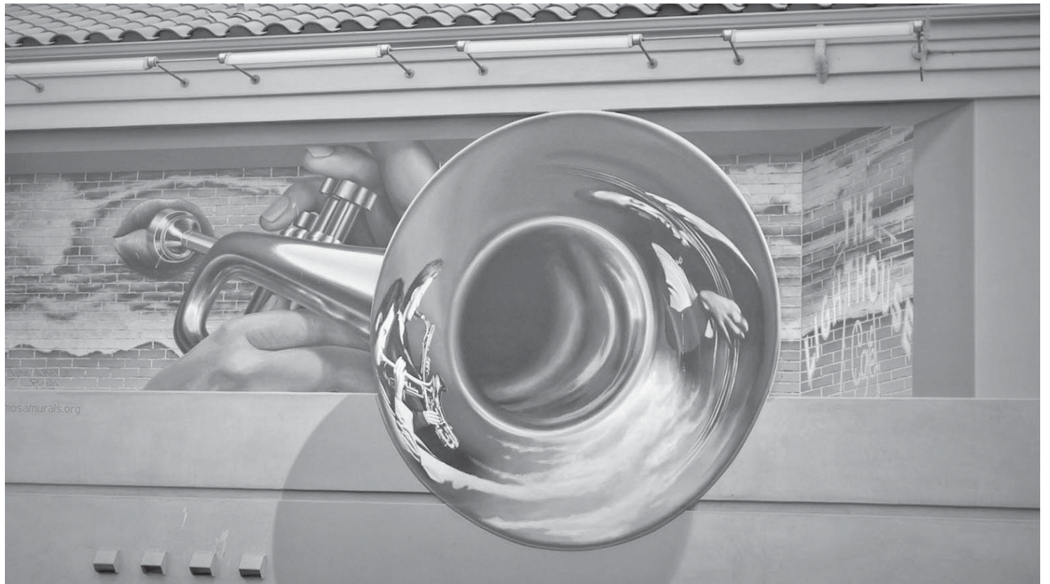
Unique murals can be found all over the South Bay capturing the history and culture of Southern California. Murals, like this one in Hermosa Beach, beautify buildings while documenting a city's rich culture.